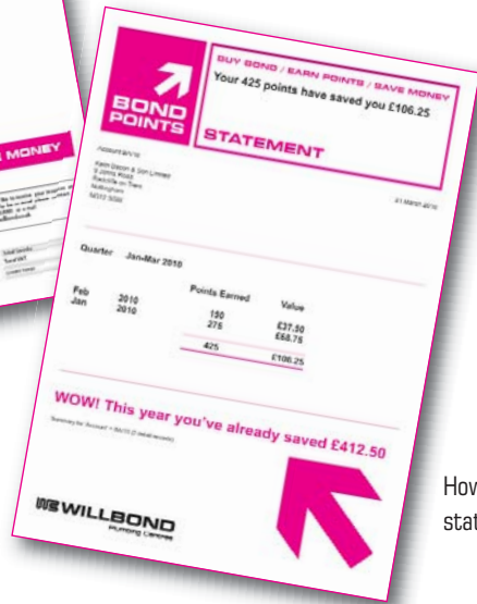
How your BOND POINTS statement will look

Every time you make a BOND purchase, our invoice will show the number of BOND POINTS you've earned. We'll send you a statement every quarter showing the total number of points on your account together with a credit note for the corresponding monetary value.