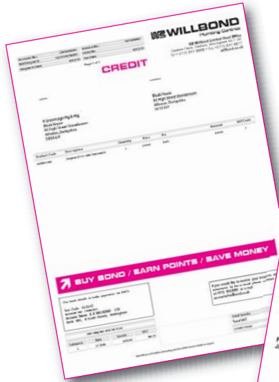
A typical BOND POINTS credit note

There's NO NEED TO REGISTER for, or claim BOND POINTS – our computer system does it all automatically including raising your credit note .